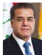
Falah M. Bakir, Chair of Organizing Committee Minister of Foreign Relations (Diaspora)