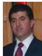
Nechirvan Barzani Prime Minister, Kurdistan Regional Government

We appreciate your effort participating in the 2nd Scientific World Kurdish Congress. We wish you a rewarding and enjoyable congress in Erbil as you visit our county or greet your own country for networking with your new and old Kurdish colleagues.