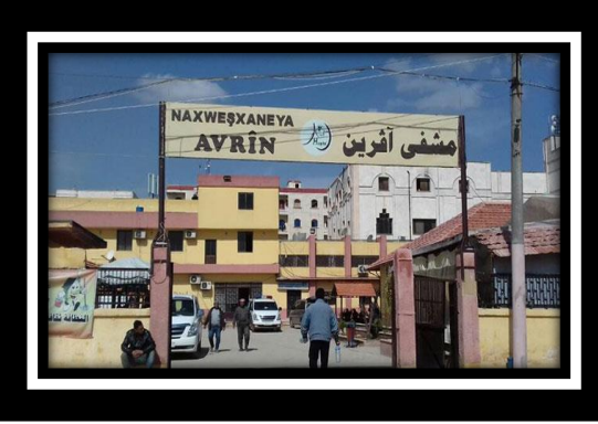
Afrin Hospital After Turkish Occupation