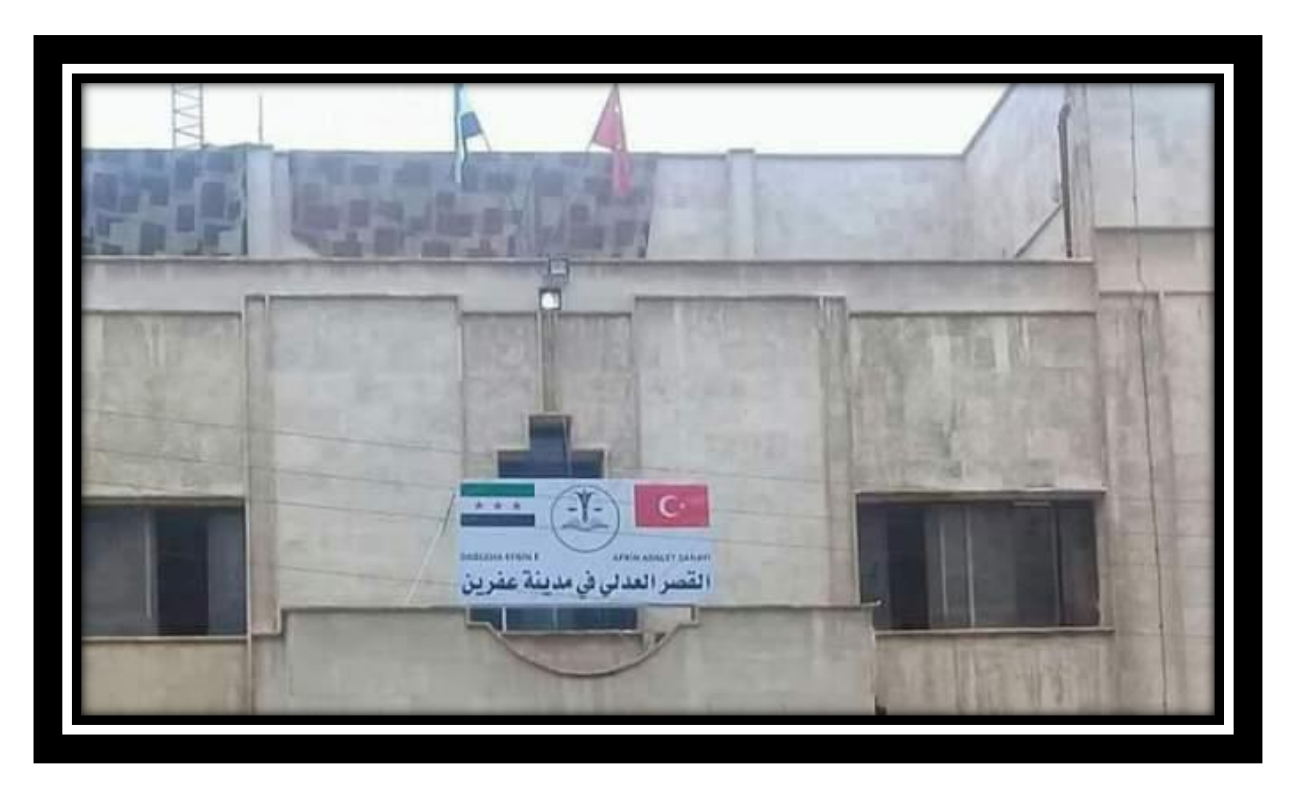
The Justice Palace Now