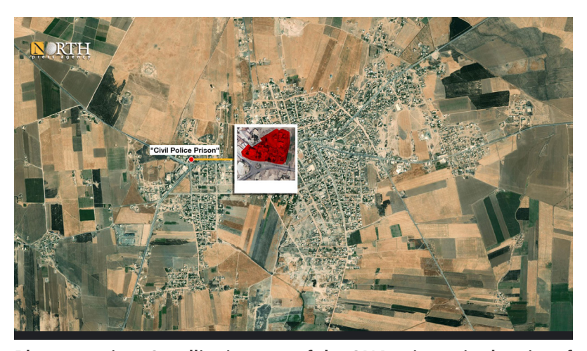
Photo caption: Satellite images of the SNA prisons in the city of Tel Abyad and the town of Suluk in the north of Raqqa, northern Syria