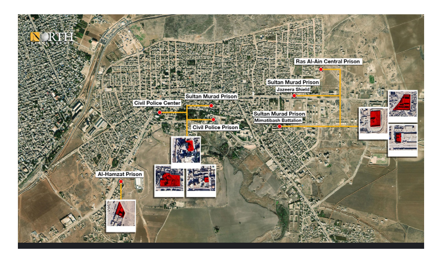
Photo caption: Satellite images of the SNA prisons in the city of Sere Kaniye (Ras al-Ain) in the north of Hasakah, northeast Syria

Our Department also confirmed the coordinates of seven prisons and security centers in Sere Kaniye, including three prisons of the Sultan Murad Faction, one of the al-Hamzat faction, a center, and prison of the Civil Police, and the Central Prison in the city.