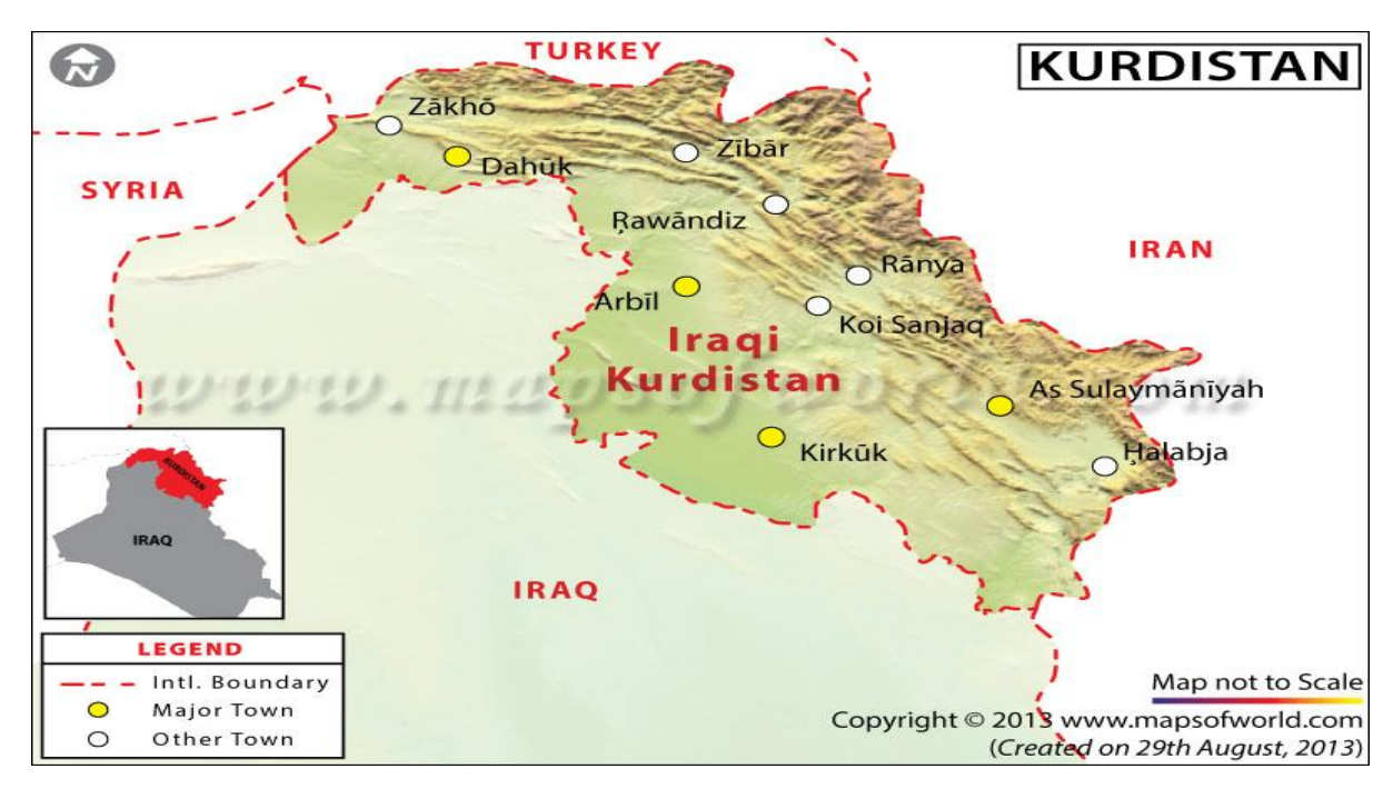
Figure 1: Topographic map of south Kurdistan