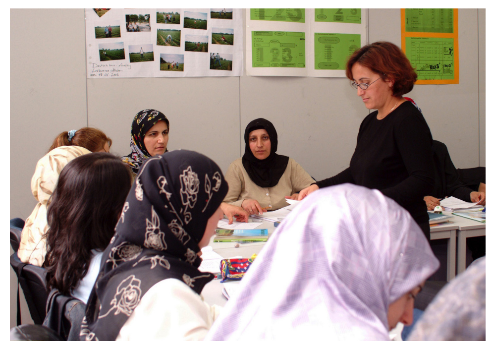
Kurdish women participate in German language classes in Berlin, Germany, June 1, 2004.

diaspora and to the homeland. A small professional elite group of artists, writers, and musicians forged corresponding networks (Ammann, 2004: 1013f).