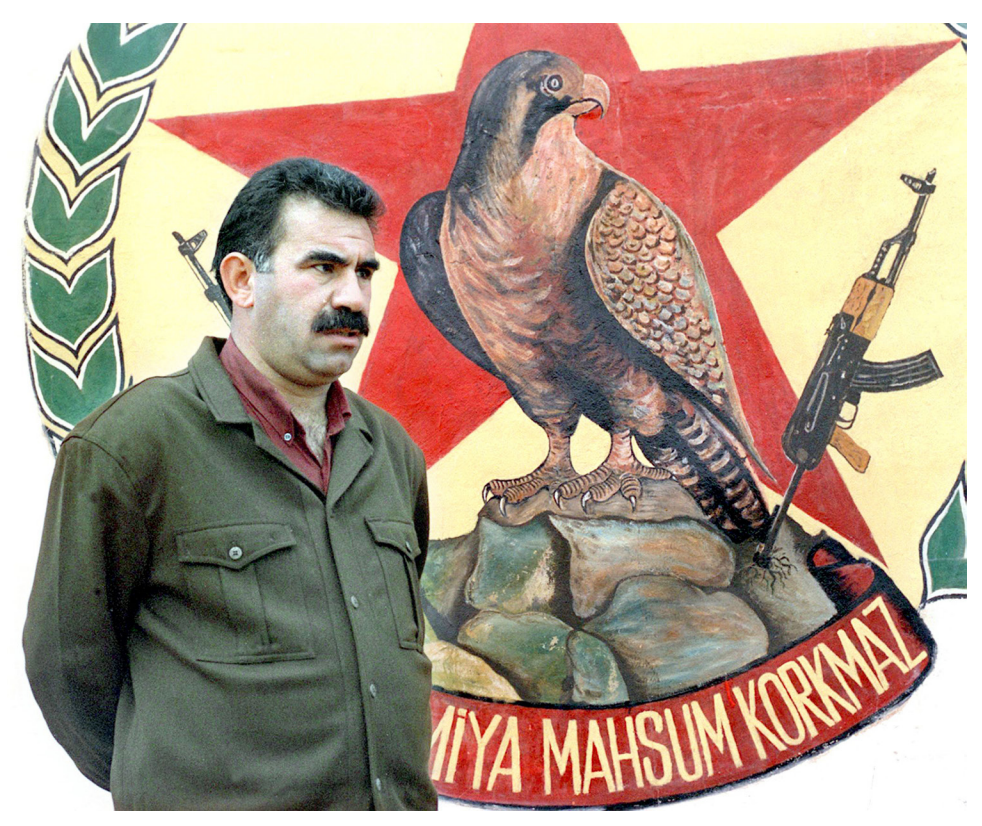
Abdullah Öcalan, one of the founders and first leader of the Kurdistan Workers' Party (PKK), in a photo from 1992.

the aim of establishing an independent Kurdish state achieved through war against the Turkish regime. In 1979, Öcalan fled to Syria, where he remained until 1998, when the Syrian government expelled him in the face of threats from Turkey.