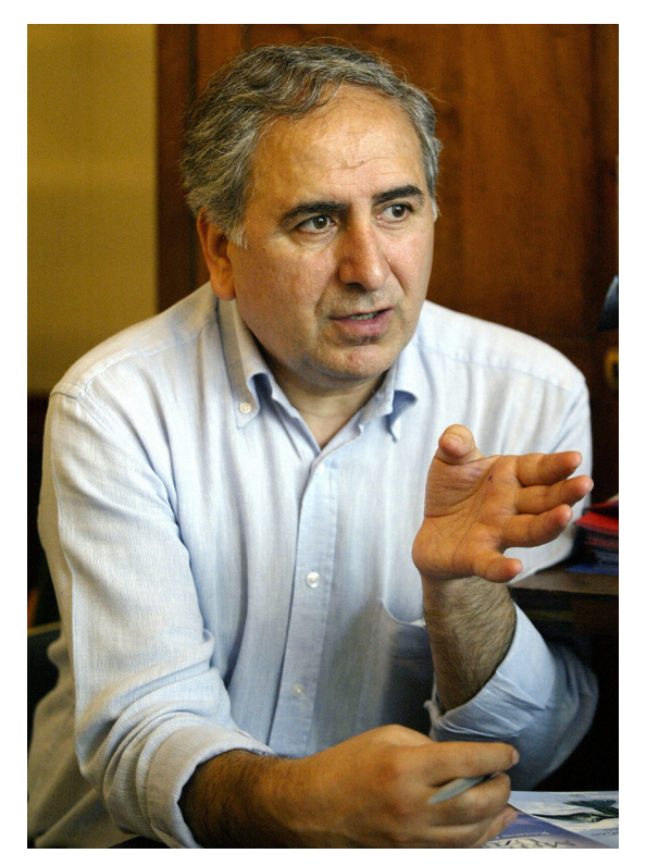
Kurdish novelist Mehmed Uzun during an interview in Istanbul, Turkey, June 28, 2005.

deals with the problems of terminology and standardization of the Kurdish language. Similarly, N\hat{u}dem (New Era), founded by Cewerî, was published from 1992 to 2002 and played a considerable role in the development of Kurdish literature.