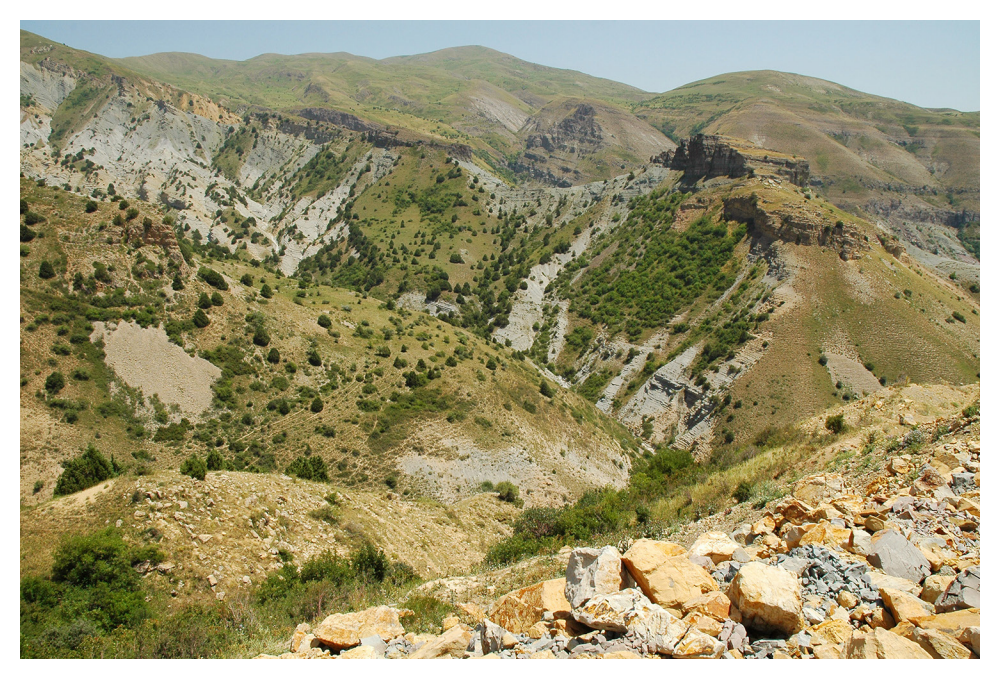
Rugged mountains in northern Kurdistan, eastern Turkey.

While the Middle East suffers from a lack of water sources, the mountainous feature of Kurdistan distinguishes it from the rest of the Middle East as having precious rich water sources. The Euphrates and Tigris rivers and their tributaries have been the most significant water sources in the Middle East, which derive from northern Kurdistan in Turkey. These rivers flow through Syria and Iraq and meet at the Shatt al-Arab in southern Iraq to join the Persian Gulf. The area between Euphrates and Tigris is called Mesopotamia, or the land between the two rivers, which is one of the most fertile regions and a cradle of civilization. Moreover, Kurdistan includes other rivers such as the Khabur, Murat, Greater Zab, Little Zab, Aras, Sirvan, Safid Rud, and Zarrinehrud. In addition to rivers, there are many lakes in Kurdistan—the largest of these are Lake Urmiah (5,500 square kilometers) and Lake Van (3,713 square kilometers), which are very salty.