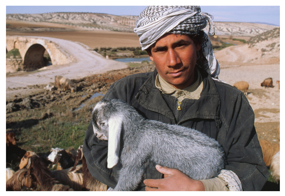
Shepherd from Efrin, Syria, where many of the country's Kurds live in a traditional, rural environment.