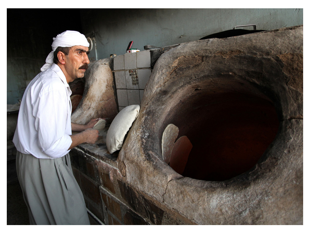
All over Kurdistan there are small traditional bakeries. The fresh bread is sold directly from the bakery window.

A typical Kurdish breakfast starts at home in the morning with fresh bread ( naan ), yogurt, eggs, cheese, and black sweet tea. Fresh flatbread (also known as dorik or lavash ) is available almost everywhere at local bakeries. Lunch is usually