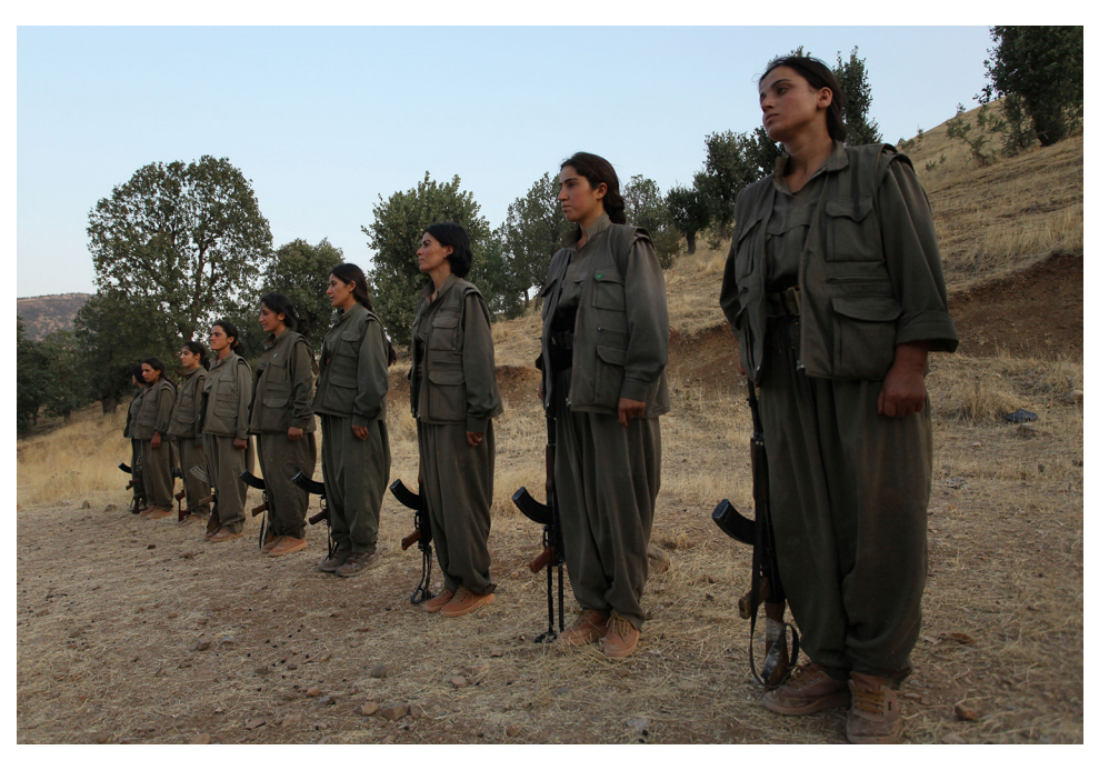
Kurdistan Workers' Party (PKK) female fighters in the Qandil Mountains of Iraqi Kurdistan.

Bravery and the use of violence were clearly linked to manhood. Vice versa, war is a masculine undertaking. Women who take up arms and fight for their nation thus trespass an important gender norm. Linguistically, such women have long been described as men-women, or women who imitate men or have a boyish