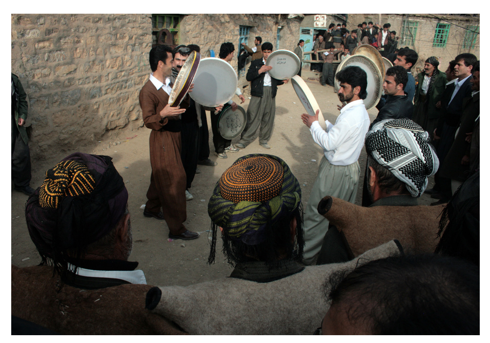
Kurds in Iran celebrate the festival of Pir Shaliyar in the village of Uraman Takht.

Due to their strategic locations, the mountainous areas of Iranian Kurdistan have always been havens to nonconforming religious sects—including different Sufi orders—as well as political dissenters. Following the suppression of Abu Muslim Khorasani's rebellion by the Abbasid Caliph in the eighth century, his followers took refuge in Kurdistan where they pursued their activities with freedom.