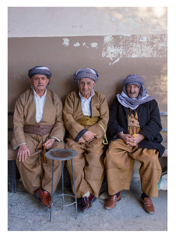
Iraqi Kurdish men, wearing traditional baggy trousers, headscarves, and prayer chains, sit outside a tea house in the bazaar of Dohuk, Iraqi Kurdistan.

open-collar jackets made from the same material and design. This loose outfit is held in place by a shawl or belt up to 30 feet long made of printed silk or synthetic material wrapped around the waist. This sash could also hold smaller accessories like tobacco, knifes, money, and cell phones. Underneath the outfit, Kurdish men wear cotton undershirts and pants. On their feet, they used to wear heavy cloth shoes, kalash, that were hammered together and had protective leather stripes at the edges. In the summer time plastic (formerly leather) sandals are the preferred footwear, whereas in the colder winter days and especially in the mountains, leather boots are more common. As common in Muslim societies, men cover their heads too. A skullcap and a colorful scarf wrapped around it is the most popular form. Often the black and white checkered kuffiye is worn around