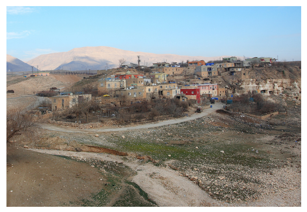
Landscape with the old Kurdish town of Hasankeyf, in southeastern Turkey.

particularly by goats, led to considerable deforesting of the wooded areas (Strohmeier & Yalcin-Heckmann, 2003: 23). The outbreak of the war between the PKK and Turkish state has worsened the deforestation further in the region. Beside the harmful effects of war itself, the Turkish military has burnt down some forested areas in order to deny PKK fighters a hideout and shelter.