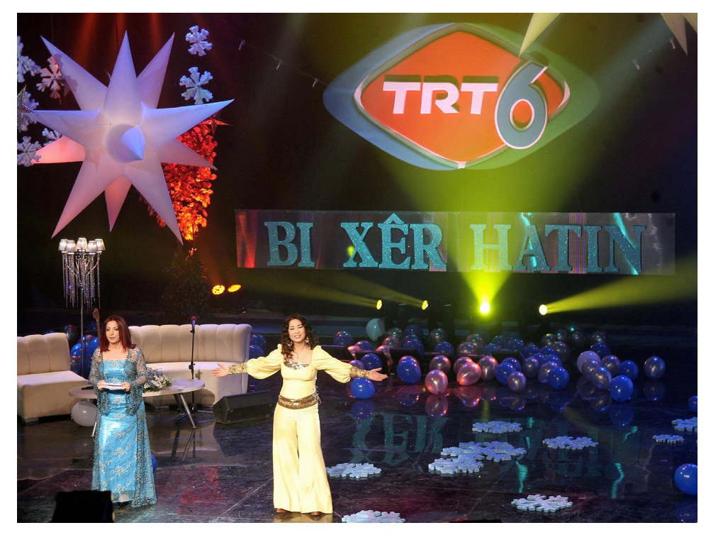
Opening ceremony of the Kurdish-language, state-run television channel TRT 6 or TRT Kurdi, on January 1, 2009.

For nearly a decade, Turkey also experimented with ethnic co-optation strategies and tried to reach out to particular Kurdish population groups through statemanaged Kurdish-language media. Turkey established a state-funded Kurdishlanguage TV station, TRT6, in 2009. The aim of the Turkish Radio and Television