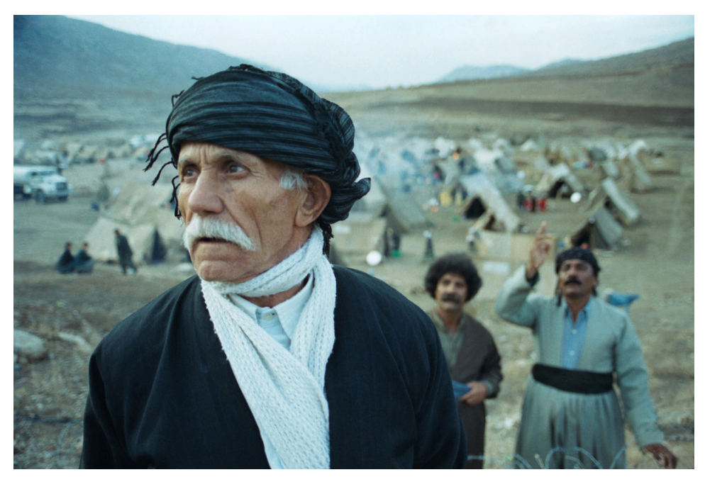
Scene still from the film Marooned in Iraq (2002), directed by Bahman Ghobadi.

attention in terms of its political and cultural status especially after the first Gulf War in 1991. Due to the interventionist politics of the United States in countries like Iraq, Iran, and Syria, the cause of Kurdish people has become more of an issue in international arenas. Starting from the Gulf War to the current turmoil in Syria, the position of the Kurdish people and their resistance has always been at the core of the geopolitical conflicts. As a result of these changes in political circumstances, the Kurdish people have found the opportunity to reflect their lack of social status through cinema (Cicek, 2009: 3).