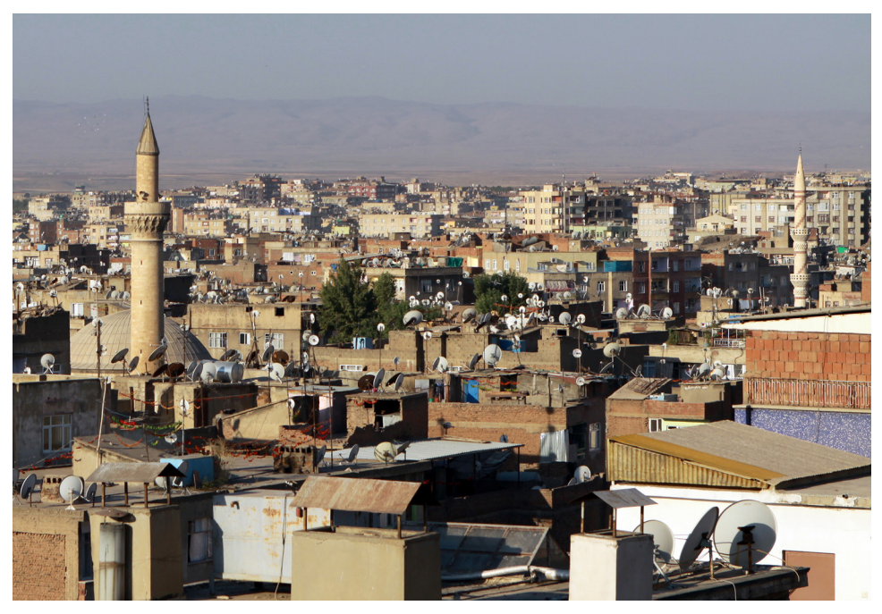
View of Diyarbakir (Amed), one of the largest Kurdish cities in Turkey.