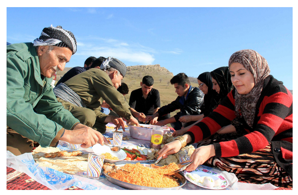
A Kurdish family enjoys a picnic in the mountains near Qaladiza, Iraqi Kurdistan, 2014.

household had authority over all other female and male family members. He controlled the financial resources and the physical movement of the other family members. Upon the death of the senior male in the household, the role of the "patriarch" was inherited by his younger brother or eldest son. Women who had passed reproductive age and who had born sons could also gain considerable respect and authority within the household and especially its female members. Elderly women could also (indirectly) influence decisions made by the male head and, in some instances, take over their husbands' role as the head of the household . Traditionally, but also today, the elder generation, including elder brothers, enjoy great respect from the young. Younger family members often demonstrate their respect through a special greeting ritual, where the hand of the elder is kissed and put on the young person's forehead. Young people normally refrain from smoking, speaking loudly, or sitting comfortably in front of elder members of authority. They will also consult the elders in important decisions such as marriage, education, choice of job, or settlement. However, whether elders can influence or even dictate such decisions varies greatly. Children, on the other hand, are raised relatively freely when young. Responsibilities increase relative to their age, and especially girls often experience a restriction of their action space when approaching puberty.