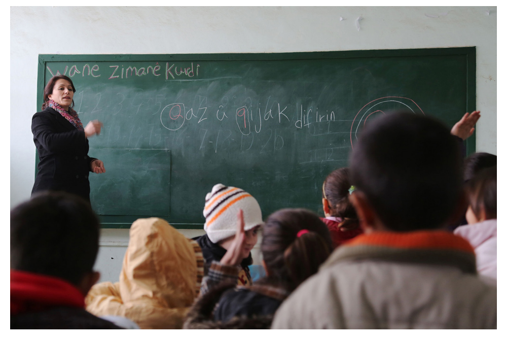
A Kurdish teacher conducts class in the Syrian city of Qamishli, January 31, 2016.

initiatives was the opening of asiret mektebi (tribal school), and another one was the Kurdish Constitutionalism School opened by the Kurdish Education Association in Istanbul. Other Kurdish associations were founded by Kurdish intellectuals with the goal of providing literacy to the Kurdish population. Ultimately, they wanted to start schools for Kurdish language, literature, education, and publication. The first of these schools was opened in Istanbul in an area with a high concentration of Kurds. The community was excited about this opportunity, and they petitioned for the opening of similar schools in other parts of Kurdistan. With the rise of Turkish nationalism, the trend of furthering Kurdish education was reversed, and many schools were closed largely for displaying the word Kurd on their banners and signs.