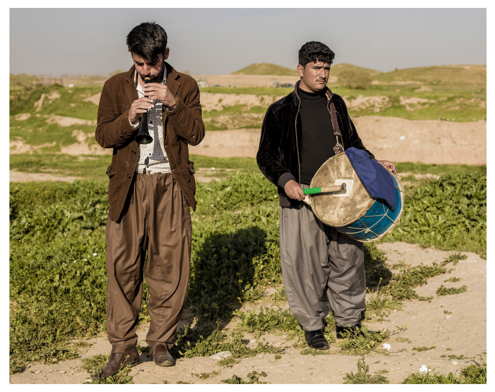
Men play traditional Kurdish music in the Kurdistan region of Iraq, 2016.

Dance songs are very often performed with instrumental accompaniment, although antiphonal (two groups of singers singing alternating musical phrases) or responsorial (call and response) performances used to be common in some areas in the past. The instruments used depend on the area. However, until recently the dehol (double-headed drum) and zirne (a type of shawm) pair constituted the most