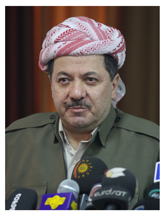
Masoud Barzani, president of the Iraqi Kurdistan region (2005–2017) and leader of the Kurdistan Democratic Party (KDP), at a press conference on January 5, 2008.

The political system of the Kurdish region of Iraq is a mixed system with a president and a unicameral parliament. The president is the top executive and the most powerful individual in the political system. Masoud Barzani has been the president of the Kurdish region since 1992. His second and final term since 2005 was sched-