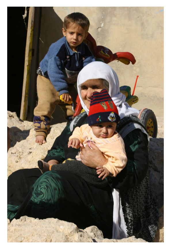
Kurdish refugees in the United Nations-administered Makhmur refugee camp in Kurdistan, northern Iraq, January 26, 2007.

and was established as a humanitarian effort to protect Kurds in northern Iraq and Shi'a Muslims in the south The zone was controversial as it was not authorized by the United Nations or specifically sanctioned by a Security Council resolution. Another controversial issue surrounding the creation of the no-fly zone was that the no-fly zone did not cover Sulaymaniyah, Kirkuk, and several other areas with notable Kurdish populations. Nevertheless, the no-fly zone did manage to help and protect Kurds and other groups against the Iraqi military action that had driven large numbers of people across the borders into Turkey and Iran. The no-fly zone also allowed Kurdish leaders, together with armed Peshmerga forces, to strengthen their hold in the north of Iraq in the wake of the withdrawal of Iraqi forces. Fierce battles between Iraqi forces and Kurdish rebels continued despite