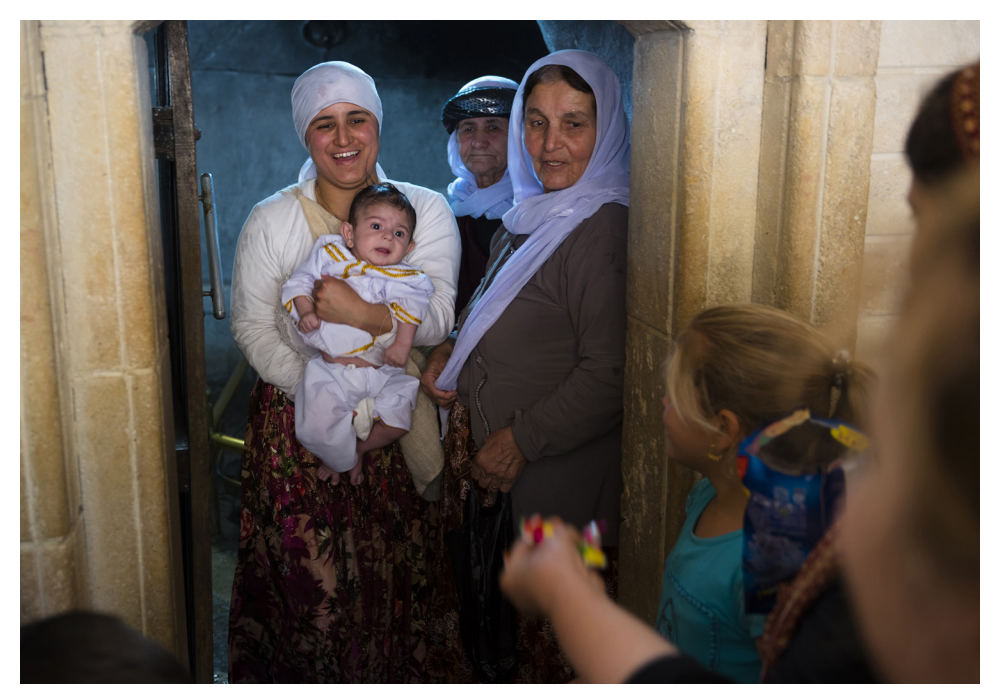
A Yezidi family baptizes an infant in the village of Lalish, Iraq, September 12, 2017. The Yezidis are an ethno-religious minority indigenous to northern Mesopotamia.

them in northern Iraq for the purposes of genocide, claiming that they wanted to purify Iraq and its neighbors of the infidels. Moreover, around 10,000 Yezidis who once lived in Turkey migrated to Germany during the 1980s, because they could no longer live in their homeland. Despite their being a small ethnic and religious minority, the Yezidis and their faith have fascinated a considerable number of travelers and scholars since the middle of the 19th century. As a result, they have been the subject of many publications to date. Indeed, the ISIS genocide attempt has highlighted the existence of the sect for not only Westerners, but also the neighboring countries and communities in the region.