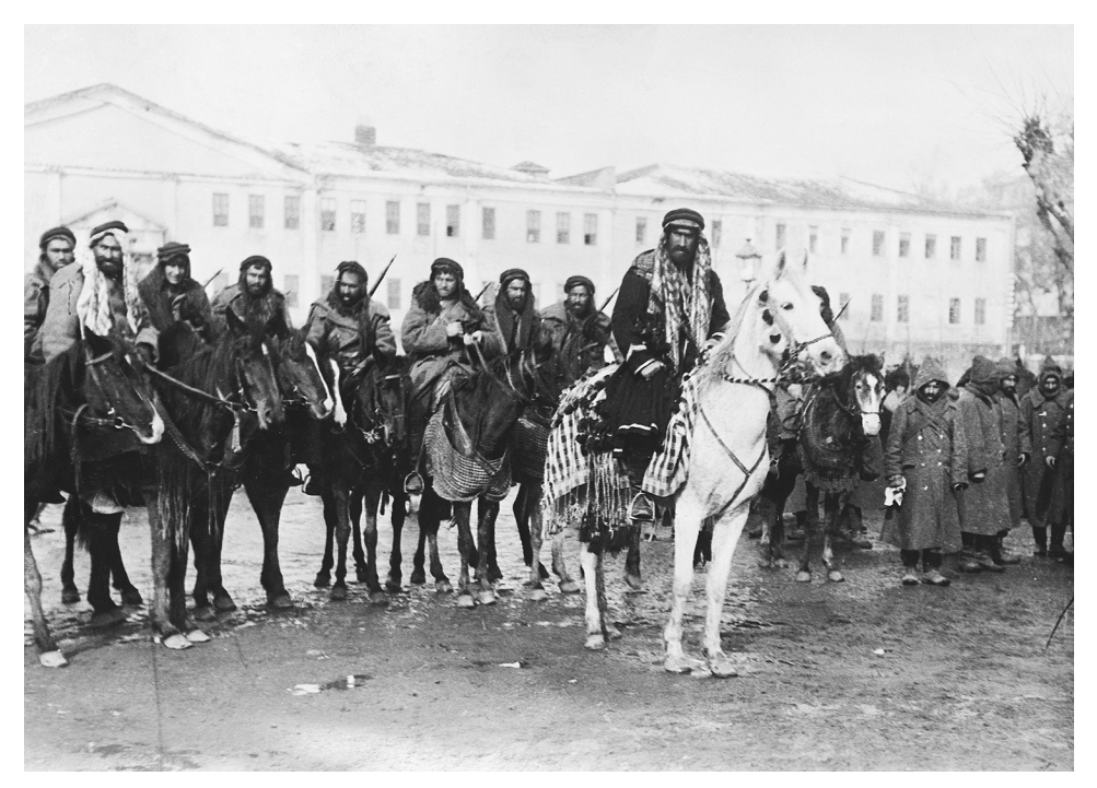
The Hamidiye light cavalry troops were recruited from among Kurdish tribes to support the Ottoman army against revolts and rebellions, and to protect the borders.

Between 1905 and 1908, a wave of revolutionary fervor swept the Middle East, ushering in the advent of constitutional rule in both Iran and the Ottoman Empire. In 1905, a wave of popular protests across Iran forced Shah Mozaffar ad-Din (r. 1896– 1907) into promulgating a constitution in December 1906. However, this brief experiment in constitutionalism proved disastrous. The shah died only days after granting Persia its basic law. Iran's new ruler, Shah Muhammad Ali (r. 1907–1909), moved against the new parliament and the constitutionalists and, in 1908, with British and Russian connivance, eliminated the parliament. In July 1909, constitutionalist forces re-established authority and the shah's 11-year-old son, Shah Ahmad (r. 1909–1925), was placed on the throne. However, by this time, central government authority had all but collapsed, and both Russia and British as well as the Ottoman soldiers and officials routinely violated Persian sovereignty. In Iranian Kurdistan, the feebleness of Tehran's authority meant that the region had become a refuge for Kurdish rebels and revolutionaries fleeing the more vigorous