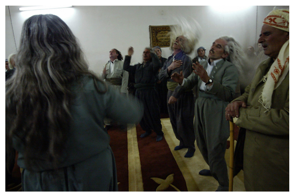
Sufism is a very popular form of the Muslim religion in Kurdistan. Here, Iraqi Kurdish dervishes perform a Sufi ritual in Erbil, 2008.

the year 642 CE, the Arab conquerors arrived at the central and strategic city of Nihavend, where a great war broke out between the Sassanid army and the Muslim Arabs. This war is known as the "Nihavend war" in Iran and Fatah al-Futuh (Great Victory) in the Islamic world. The defeat of the Iranians in Nihavend was the most significant blow to the Sassanid Empire, and shortly thereafter, the Sassanid Empire was torn apart forever.