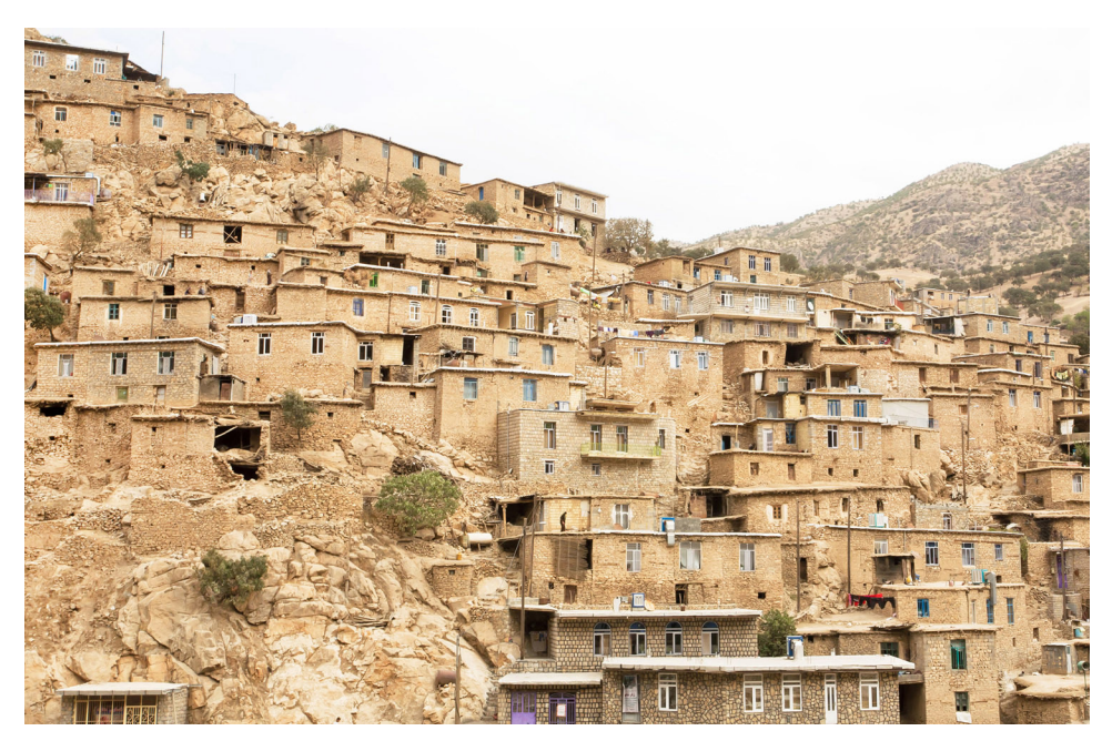
Traditional mudbrick housing in the mountain village of Palangan, in the Kurdistan region of Iran.

The Kurdistan region of northwestern Iran is another example of a mountainous dwelling place. As in the Iraqi Kurdistan region, the houses here are oriented toward the south, allowing them to receive the maximum amount of sunlight in