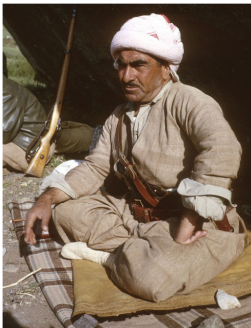
Mullah Mustafa Barzani

During the emergence and rise of the Iraqi MB, Kurdistan's concerns were different. Although the leaders of the Kurdish liberation movement throughout greater Kurdistan from the early twentieth century on had traditionally been prominent religious personalities, including Sheikh Saeed Piran, Qazi Mohammed, Sheikh Mahmoud Barzinji, Sheikh Abdul-Salam Barzani, Sheikh Ahmed Barzani, and Mullah Mustafa Barzani, none of them were Islamists.