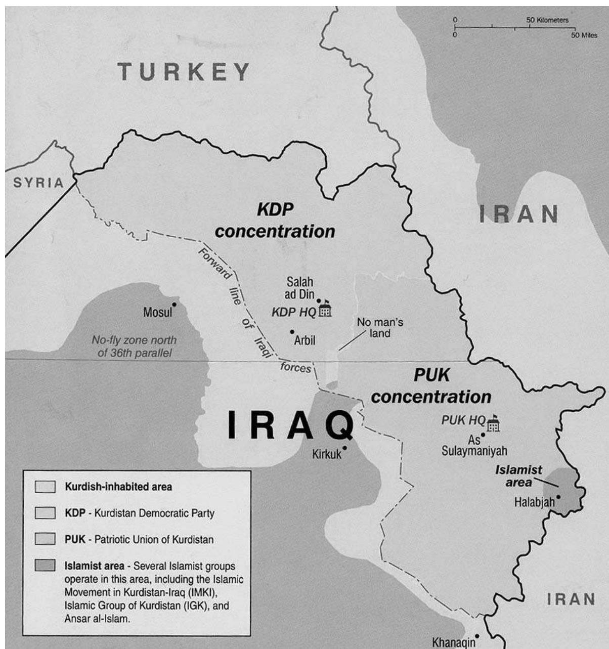
Figure 3: Map of KDP and PUK Governorates, 2003 239

First, Stansfield does not discuss how effective keeping the peshmergas separate and supporting each party was in promoting peace. Civil wars are generally prolonged due to a