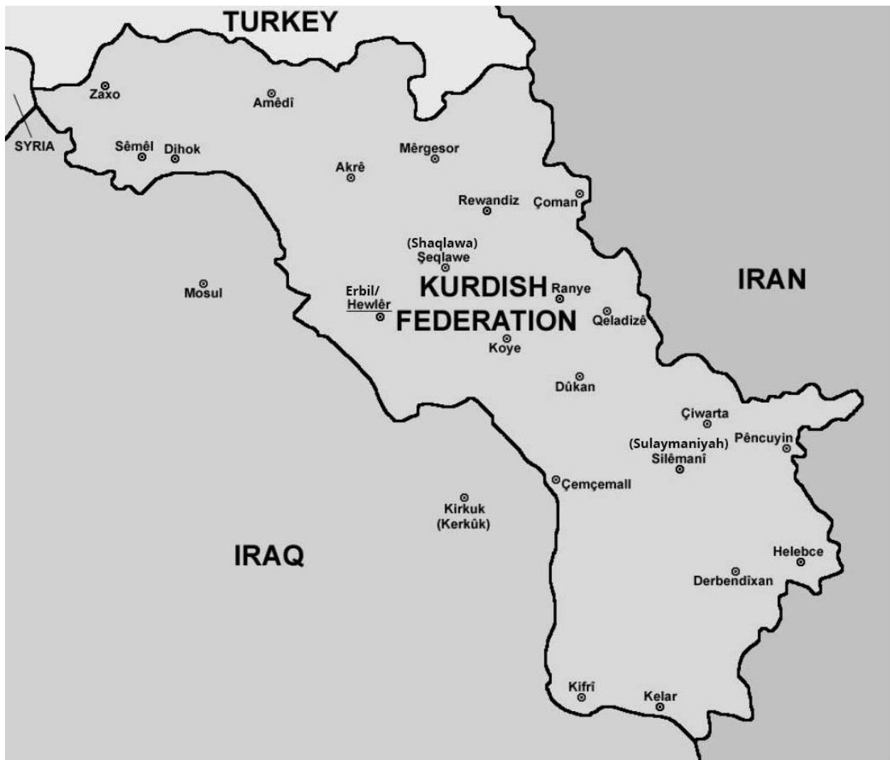
Figure 1: Map of Iraqi Kurdistan in 1998 10