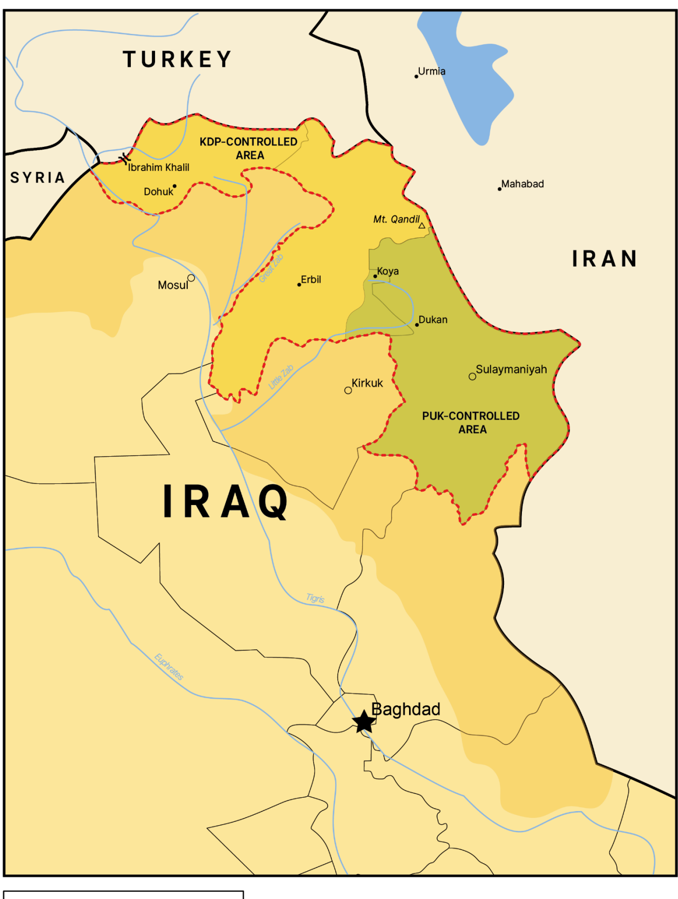
Map 3 - Kurdish Autonomy in Iraq