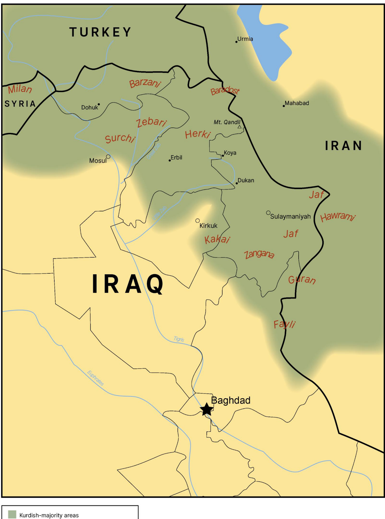
Map 2 - Kurdish Region of Iraq and Major Tribes

Zebari Major Tribe or Tribal Confederacy