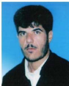
Gharib 'Aziz Mahmoud