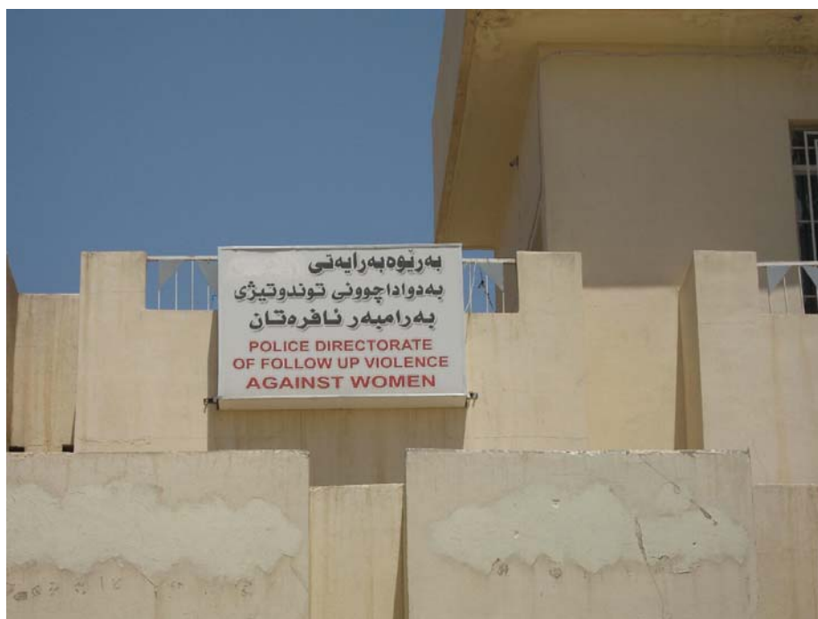
Police Directorate to Combat Violence Against Women, Erbil

While the suffering of many women victims of violence goes unnoticed by the authorities there has been an increase in the number of complaints filed against perpetrators of violent acts against women. In some cases, women have filed complaints directly with the authorities; in others, this has been done through the assistance of women's rights organizations. Hotlines for women at risk have been established by the authorities and NGOs.