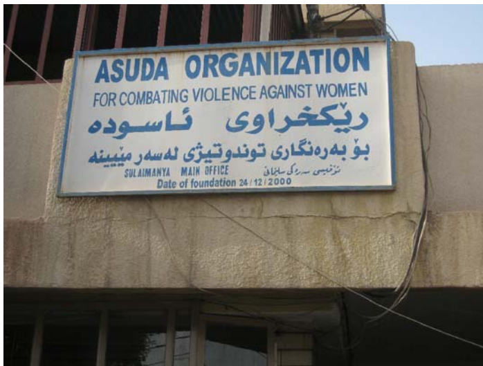
The NGO ASUDA runs a shelter in Sulaimaniya

A women caseworker at a shelter in the Kurdistan Region told Amnesty International: "I have received threats from the day I have started working here several years ago." She reported one incident in 2008 when a relative of a woman staying at the shelter threatened her by phone saying: "I want to tell you that I know you and your family name. I know that you gave the names of the men suspected of having attacked her to the police and you also wrote the letter to the court. You defend her but that is wrong. I warn you!" After the call the caseworker informed the police and as a safety measure left her workplace and took her child out of the kindergarten for that day. The caller was never identified.