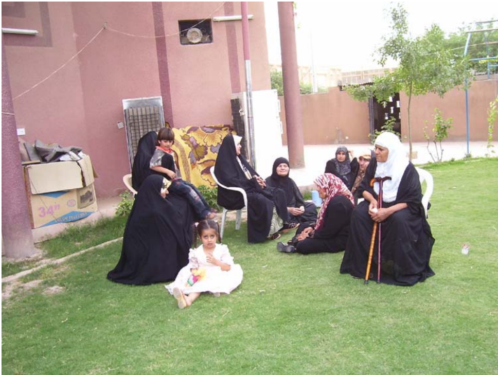
Mothers and relatives of detainees wait to be interviewed by Amnesty International May/June 2008

All Islamist detainees who have been released following amnesties, including amnesties issued by the President of the KRG, have been required, as a condition of their release, to report to the Asayish on a weekly basis and are not allowed to travel outside the governorate in which they reside without permission from the Asayish . If the released person fails to honour these conditions or commits a criminal offence, the Asayish can redetain him and confiscate his house or the house of a guarantor that he has nominated.