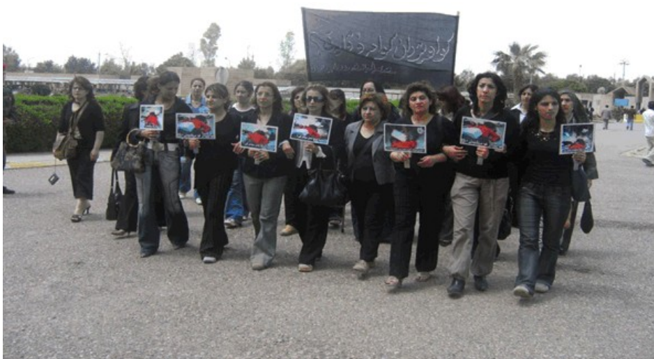
Women demonstrating against an honour killing in front of the Kurdistan Parliament, Erbil 2007.