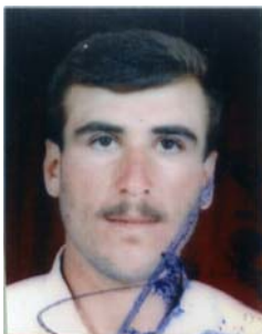
Mas'ud Mahmoud Mohammad